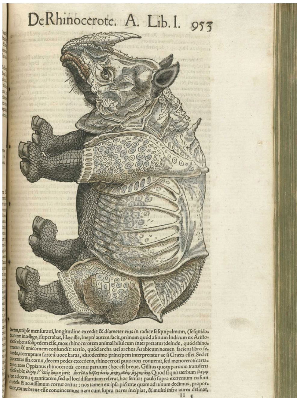
FIGURE 19.2 De Rhinocero, woodcut (page 953), Conrad Gessner, Historiae Animalium , vol. 1 (Zurich: Froschauer, 1551).