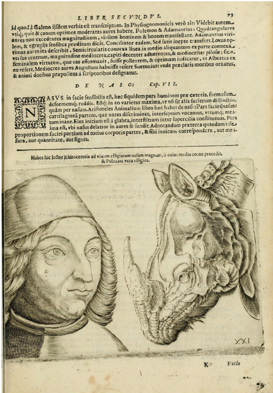
FIGURE 19.3 De Naso, engraving (plate XXI, page 73), Giambattista della Porta, De Humana Physiognomonia (Naples: Tarquinius Longum, 1602).